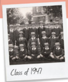
Class of 1947