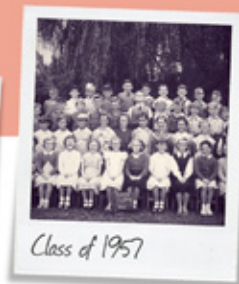
Class of 1957