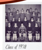
Class of 1978