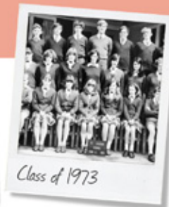
Class of 1973