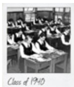
Class of 1940