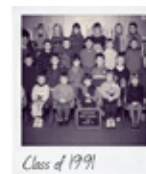
Class of 1991