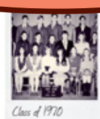
Class of 1970