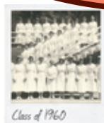
Class of 1960