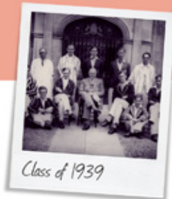
Class of 1939